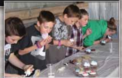
World Championship Cupcake Eating Contest