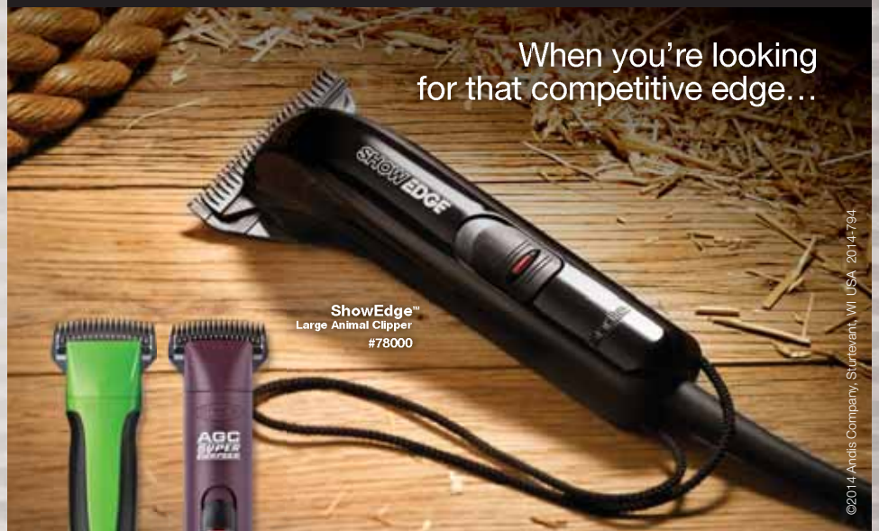
ShowEdge™ Large Animal Clipper #78000